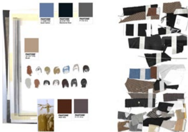
Laila Canales | Angerri